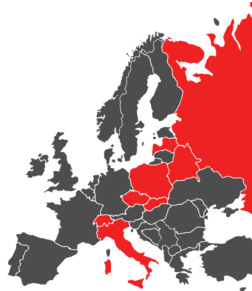
Partner Advantage Program